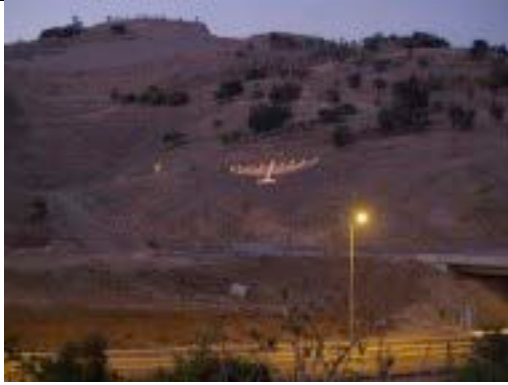
Menorah outside Maale Adumim made from hundreds of individual Yahrzeit candles- 2005.