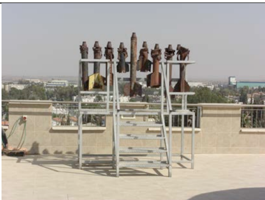
Hanukkah Menorah in Sderot, Israel made from Gaza launched kassam rockets

Editor's Note: Welcome to the Winter 2010 FIHS Newsletter. We are adding an exciting new feature this issue- FIHS Heart Beats. The goal of this section is to inform our readership of the major accomplishments and achievements of our members. We are looking for book publications, awards, and anything else that is fit to print. This section will evolve over time based on comments from you, the reader.